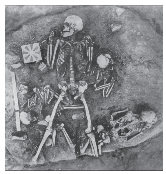
Figure 2: Man and three children found in Pit 60 from Schleinbach, Lower Austria.

skull that appeared to have been inflicted by the same tool. The relationship of these two men may perhaps be most easily understood as 'brothers in arms', who died during a raid or act of war, although other links are possible, such as both being victims of execution.