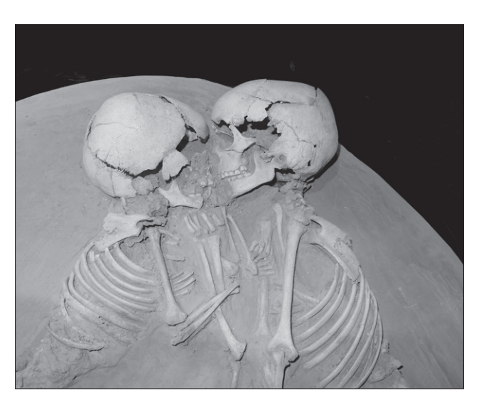
Figure 3: The children from Unterhautzenthal, as displayed at the MAMUZ museum in Asparn, Lower Austria.

At Unterhautzenthal, emotive relationships between persons were expressed in the manner that the bodies were placed in their graves. Perhaps most striking is the double burial of two children, aged two and six years, in an embrace in Feature 27, a probable former storage pit. Buried flexed on the right side, with the head to the south-west, the older child follows the regular burial rite more closely, whereas the younger one was placed in a manner that respected the position of the older child's body, and may reveal a ranking based on age (Fig. 3). The age gap of around four years would be typical for siblings in an agrarian community that breastfed their infants (e.g. see Fulminante 2015).